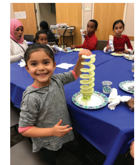
A happy girl learned how to cut an apple spiral at one of the health-centric family literacy classes.