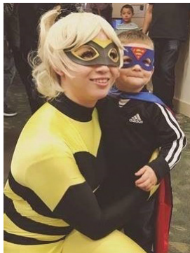
Comic Con is coming up again in October. We'd love to see you there!