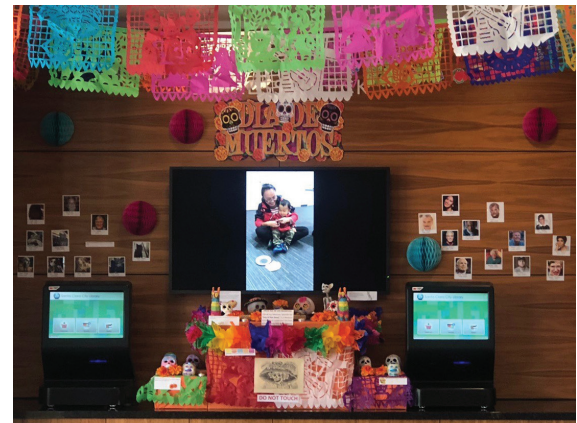
Northside set up an ofrenda to celebrate Dia de los Muertos.