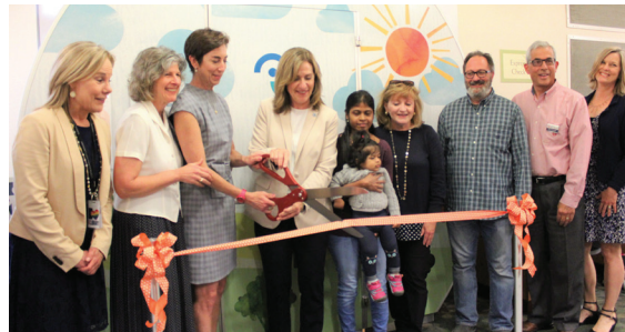
We recently celebrated the opening of the new Mamava Lactation Pod at Central Park Library, a place for those who want privacy while breastfeeding.