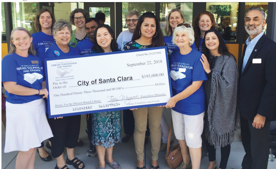
Present and former SCCLFF board members presenting the ceremonial check for $193,000 to the City of Santa Clara to support the Mission Library Renovation. Thank you for your support.

Thank you for all your support for Mission Library and the community it’s creating!