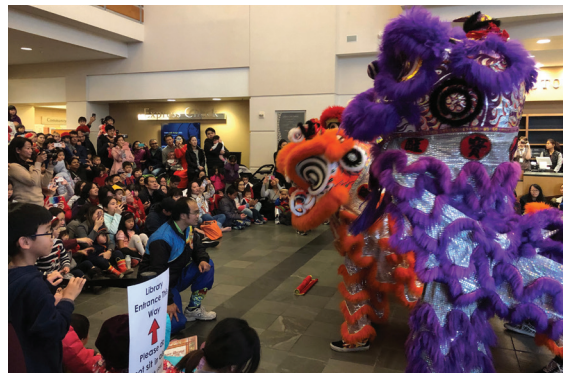
Dancing dragons are impressive and one of the most popular parts of the library's Lunar New Year celebrations.