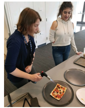
Northside Library was able to host a regular teen cooking club this year.