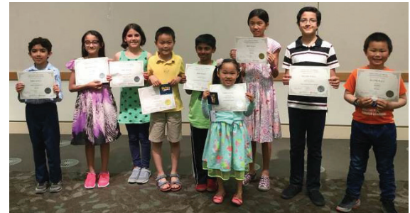
Book sale profits support prizes for the Children's Poetry Contest.