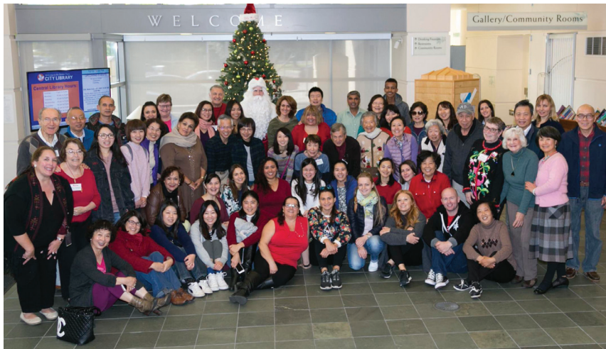
The English as a Second Language Club celebrates holidays. If you or anyone you know is learning English, please join ESL.