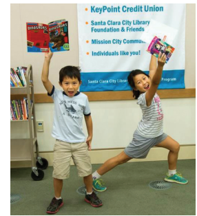
Award books for Children's Summer Reading finishers are supported with book sale revenues.