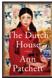
The Dutch House by Ann Patchett