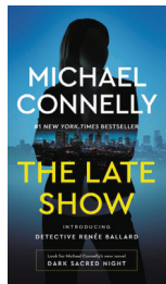
The Late Show by Michael Connelly

Here are a few books that are helping our volunteers get through their time at home.