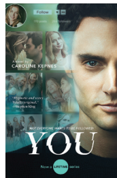
You by Carolyn Kepnes