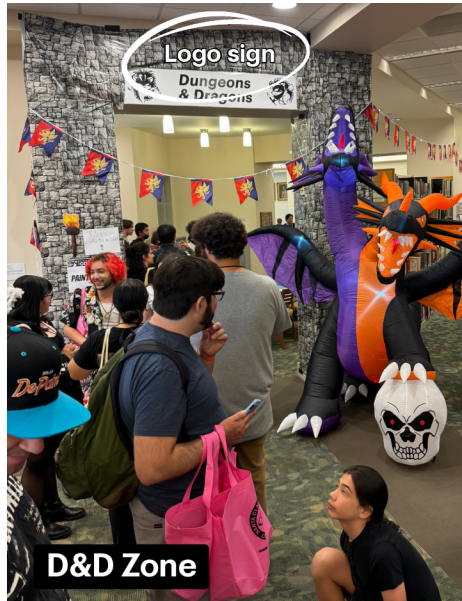
Logo sign Dungeons & Dragons